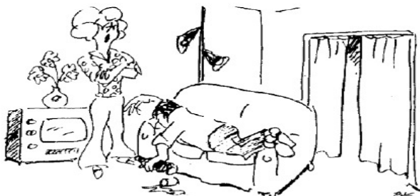
Who said you were an active alcoholic?